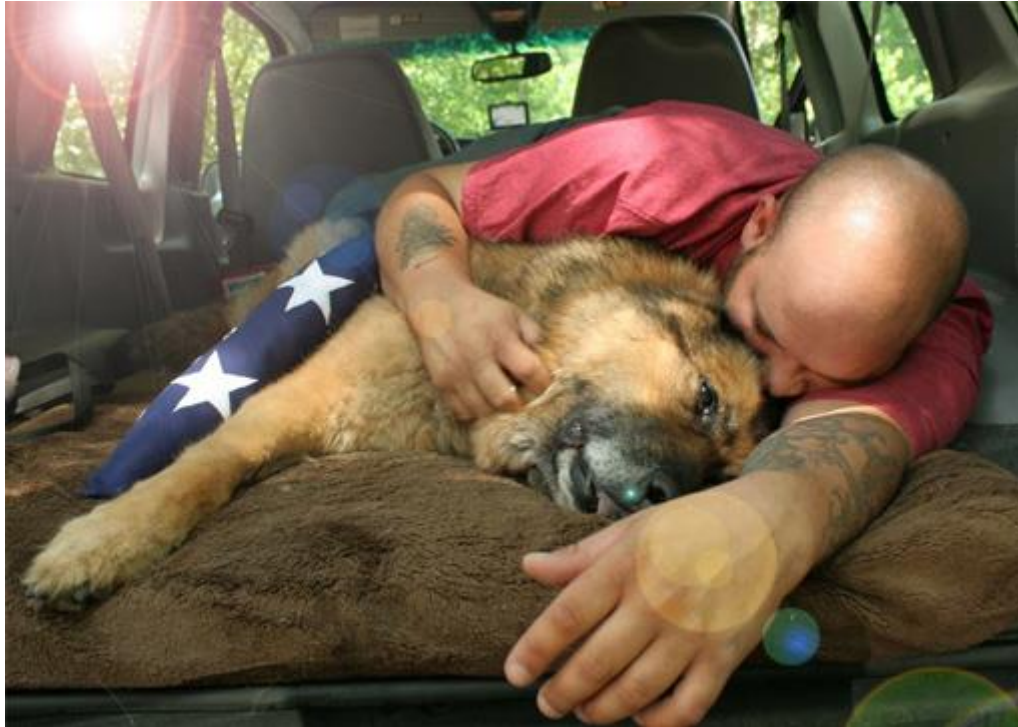
MWD NERO F156

Saveavet.org The other forgotten soldier